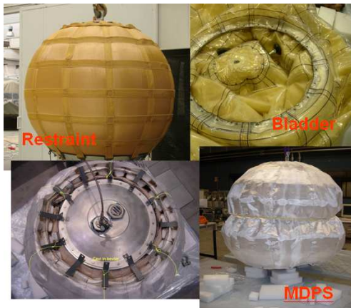
Fig. 4. FLECS Elements

To better support and demonstrate the high maturity level reached with FLECS Program, additional breadboards of the following representative subsystems have also been manufactured and tested: