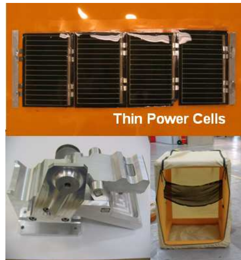
Fig. 5. FLECS subsystems breadboard

It is NASA opinion that in order to enable human space missions beyond low Earth orbit, it becomes imperative to maximize self-sufficiency and minimize the resupply of vital consumables. For considerations of crew safety, health, and mission cost, life support technologies must be developed to recycle air, water, and waste in a closed loop fashion and