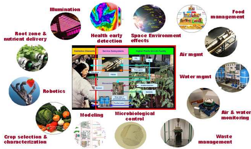
Fig. 6. CAB Functional Blocks

program, for a controlled biological life support system, allowing food production and regeneration of resources in long duration missions. The designed system can be compared to a closed ecosystem, with various subsystems that must be properly balanced and controlled to minimize the external needed contribution of mass and energy and promote self-sufficiency.