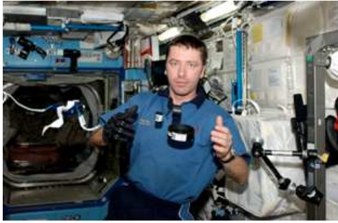
Fig. 8. HTA operated on ISS

the visual system and to detect the radiation environment on board the ISS. Operations: Two different way to utilize the instrument, with the man (CNSM) for study of light flashes and without (DOSI) as radiation dosimeter. Next utilization will verify the shielding effects of certain materials. Its operative set-up is shown in Figure 9.