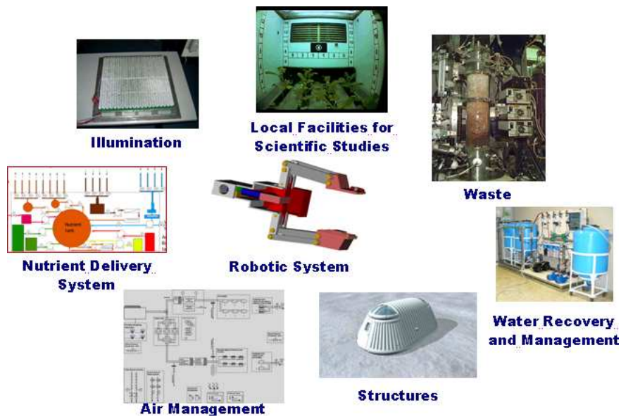
Fig. 7. CAB technological breadboard