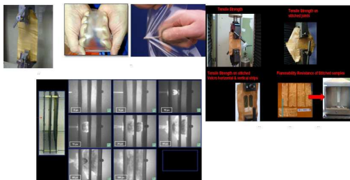
Fig. 1. FLECS material selection

The Inflatable Structures can be a relevant asset for many of these scenarios. The ASI program FLECS was conceived exactly in line with above medium-long term objectives. In 2001 ASI, with an original approach, committed a study, named SPES, aimed at the definition of the Italian State-of-the-Art on the Inflatable Structures and of their potential Space Applications. Two years later, ASI started the B Phase of FLECS Program, recently completed. With that Program, Italy has matured the autonomous capability to reach the end of that technological Roadmap, by realising a Ground-based Prototype, and analysing possible scenarios of a Space Based Demonstration Mission. Developments concerning new Materials, new manufacturing Processes, new Bonding Techniques and new I/Fs between materials not similar at all will surely imply discovery of new Application Areas even outside the Aerospace Field. A very extensive activity for Materials Selection, Characterization and Testing has been carried out at the beginning of Phase B1, as shown in the following pictures of Figure 1.