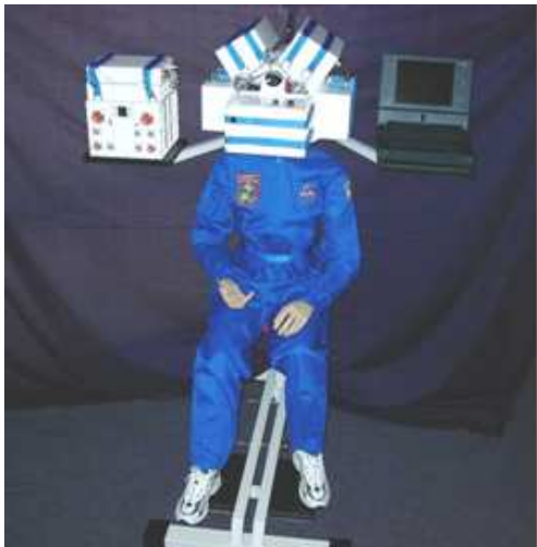
Fig. 9. ALTEA operative set-up

the visual system and to detect the radiation environment on board the ISS. Operations: Two different way to utilize the instrument, with the man (CNSM) for study of light flashes and without (DOSI) as radiation dosimeter. Next utilization will verify the shielding effects of certain materials. Its operative set-up is shown in Figure 9.