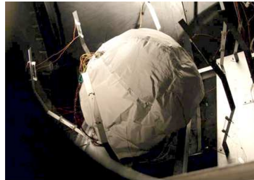
Fig. 3. FLECS TV testing

Following the Materials selection activity, FLECS Phase B2 has been dedicated to the design and manufacturing of the Habitable B/B Module, fully assembled and completed with the following elements as shown in Figure 4: