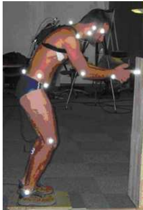
Fig. 10. ELITE operative set-up

project. Description: instrument for gathering and analysing data on man's movement in space; its objective is to study the strategies and adaptive mechanisms of central nervous system for motor control in space environment. Located in the US Labs Express Rack, it consists of an ISIS Drawer module and four infrared video cameras that take 250 images a second, installed in the upper parts of the laboratory. Operations: Reflective markers are applied to landmarks on an astronaut which movements are captured by cameras and the data elaborated for a quantitative assessment of the motion. Its operative set-up is shown in Figure 10.